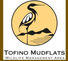
TOFINO MUDFLATS WILDLIFE MANAGEMENT AREA

“The mission of the Raincoast Education Society is to help shape an environmentally sustainable future for Clayoquot and Barkley Sound region through education and community outreach”